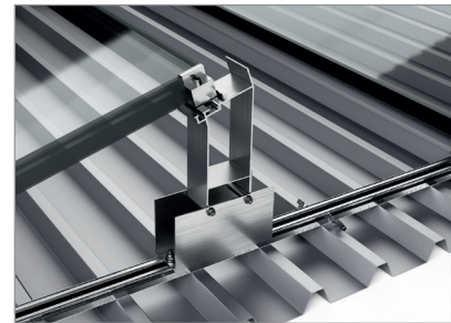
Detail back support