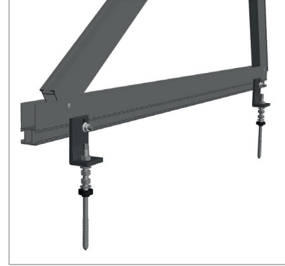
Adapter for hanger bolts